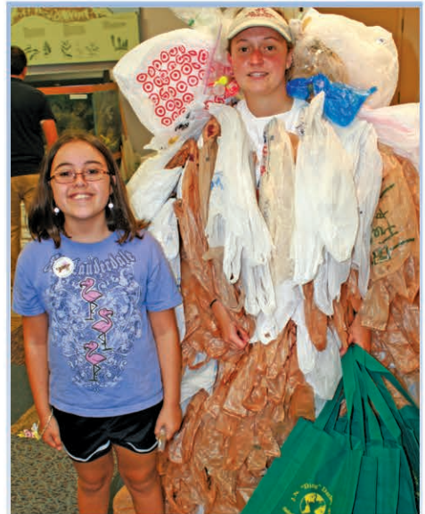
Bagzilla wears a year’s worth of an average person’s disposable bag consumption.