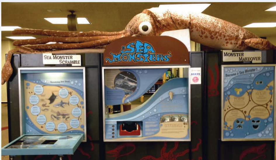
Sea Monsters invade the Refuge this summer.

The Sea Monsters exhibit’s visit to “Ding” Darling was made possible by DDWS and grants from the Southwest Florida Community Foundation and a private family foundation. Part of the grants funds will provide transportation to bring disadvantaged children to the Refuge who wouldn’t otherwise be able to come on their own and experience the exhibit.