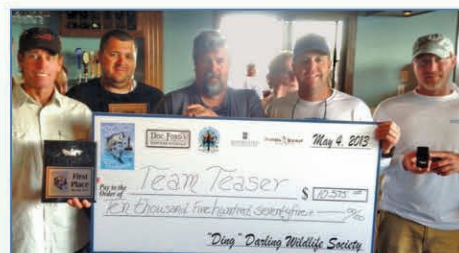
Team Teaser netted the big check for first place.