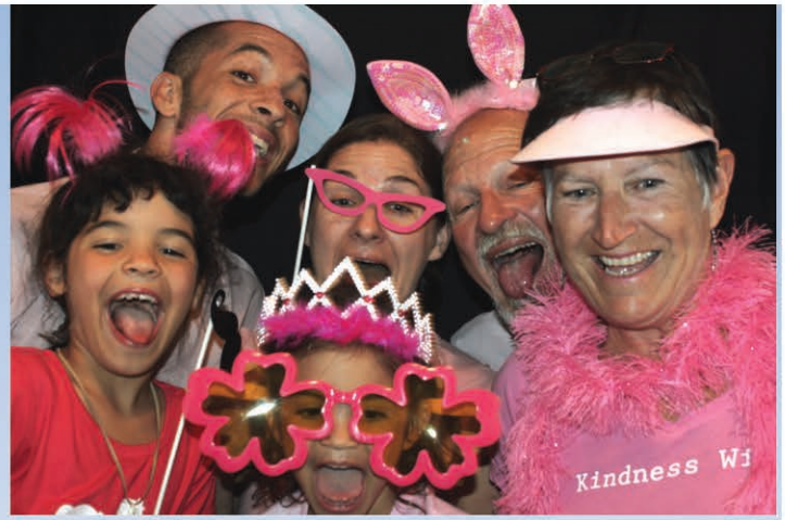
Guests and volunteers had fun in the In the Pink Photo Booth