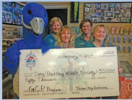
The Refuge's Blue Goose mascot poses with staff at Tarpon Bay Explorers.