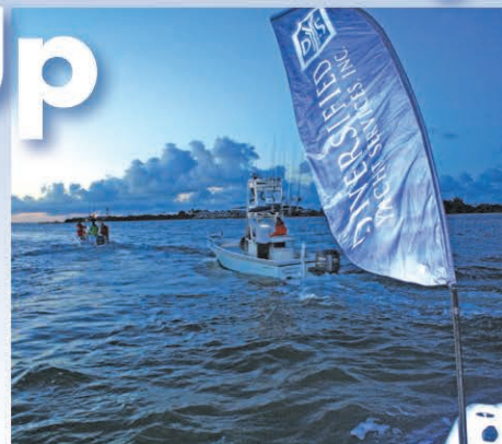
Fishermen set out at first light.

Doc Ford's — with locations on Sanibel Island, Captiva Island, and Fort Myers Beach — has again continued on page 7