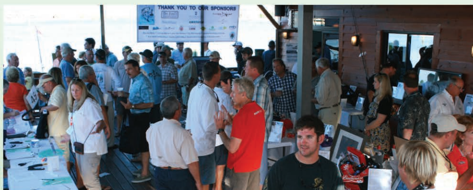
Friday's Captain's Dinner brings teams and friends to mingle, bid on silent auction items, and get their final instructions for the morning.

Title Sponsor: Doc Ford's Rum Bar & Grille; Presentation Sponsors: Diversified Yacht Services of Fort Myers Beach, Sanibel Bean; Platinum Sponsors: Florida Weekly, Lamar Advertising, Suncoast Beverage; Gold Sponsors: Anisa Jewelry; Bella Signs & Designs, Sanibel Captiva Community Bank; Silver Sponsors: Myers, Brettholtz & Company, PA; Sanibel Island Fishing Club; Semmer Electric