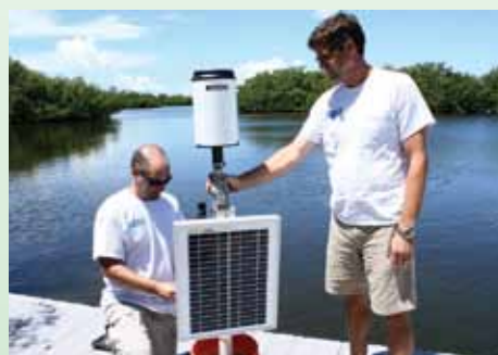
SCCF staff testing monitoring equipment funded by DDWS in 2014

Thanks to the monitoring equipment, biologists were able to assess a heavy outflow of freshwater into Tarpon Bay that could cause algal bloom. The one-way gate, installed this October, promises to alleviate the problem and improve Refuge water quality.