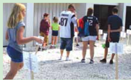
Families played the Bird Migration Game at Family Fun Day.

The two events brought visitors to the Refuge in flocks and gave us extensive opportunity to educate the public about the Migratory Bird Treaty Centennial, bird