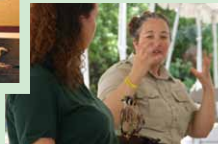
Below, a live American Kestrel starred in a Family Fun Day presentation.