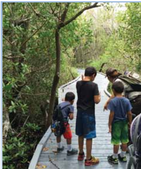
Take a guided bike along Indigo Trail every Friday from 10 to 11 a.m.