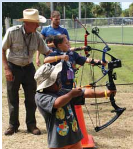
Family Fun Day archery clinics

Mark your calendars for next year's "Ding" Darling Days festivities, October 15-21, 2017. In the meantime, enjoy this pictorial flashback. See page 2 for a list of this year's generous, much-appreciated sponsors.