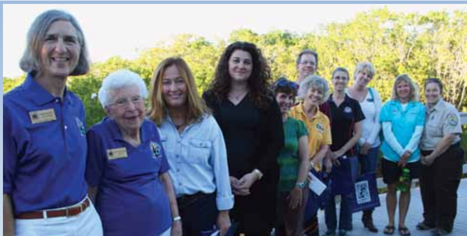
The DDWS Education Committee with awarded teachers

Grant recipients report back on their projects to the Society and Refuge, sending pictures and often thank-you notes from the students, upon completion in June 2017.