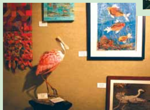
More than 50 artists from the Southwest Florida Fine Craft Guild displayed nature-related pieces in the "Engulfed" Water/Ways exhibition.